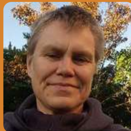
TINN, OIVE (TARTU, ESTONIE)